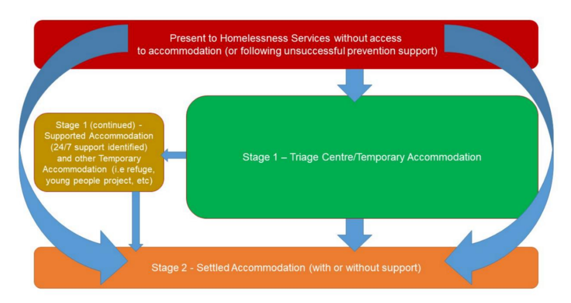
Figure 5 Rapid Rehousing model of Accommodation

Our accommodation model will follow that outlined in the Welsh Government Guidance.