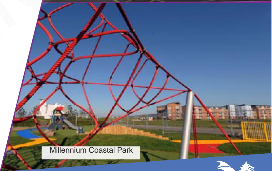
Millennium Coastal Park