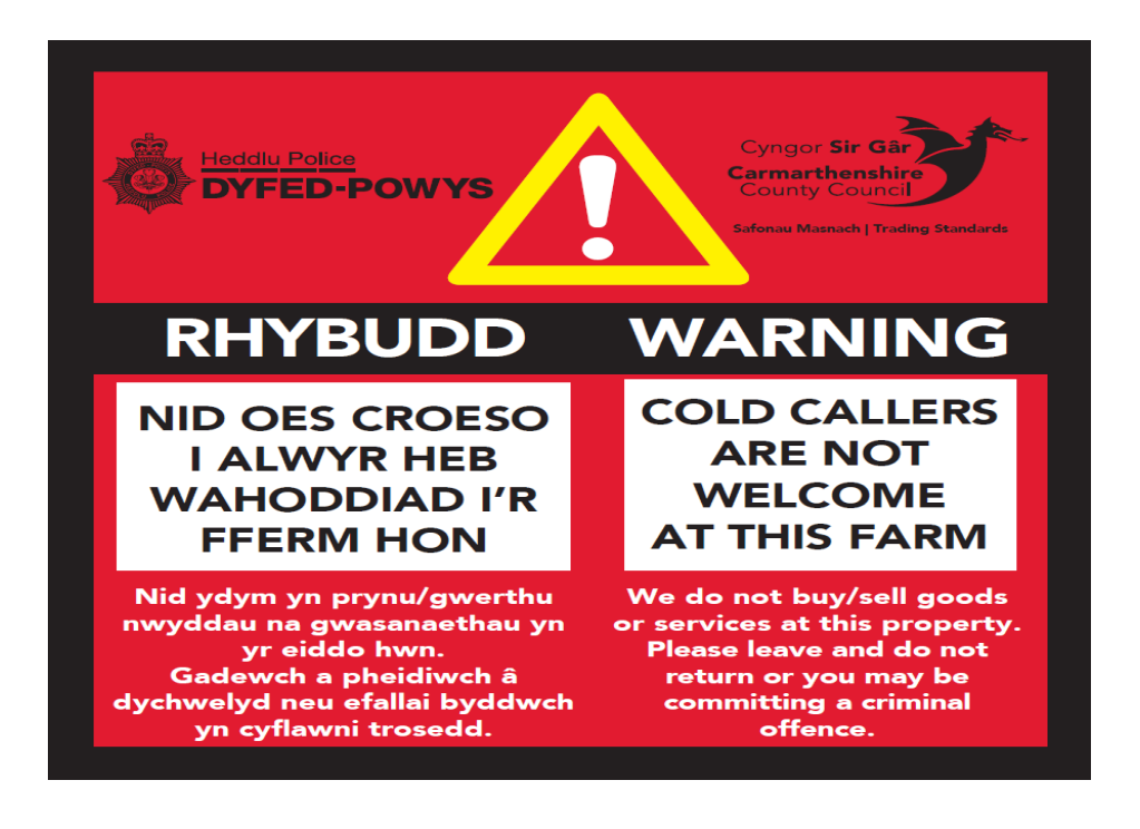
Fig 4. No Cold Calling Farms Signage:

Having identified a potential link between cold callers arriving at farms offering goods and services and subsequent thefts on farms, Trading Standards (working alongside Dyfed Powys Police Rural Crime Team) have extended the No Cold Calling Zone project to establish No Cold Calling Farms. Farmers who have been subject to cold calls and/or victims of burglaries have been encouraged to place a 'No Cold Caller' sign on their farm entrance. To date, 18 No Cold Calling Farms have been established and a further 80 farms are on a waiting list. Trading Standards have received £1050 from the Police and Crime Commissioner to help pay for signage.