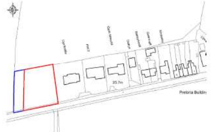
LOCATION PLAN LICENCE NUMBER = 100012867 SCALE 1:1250