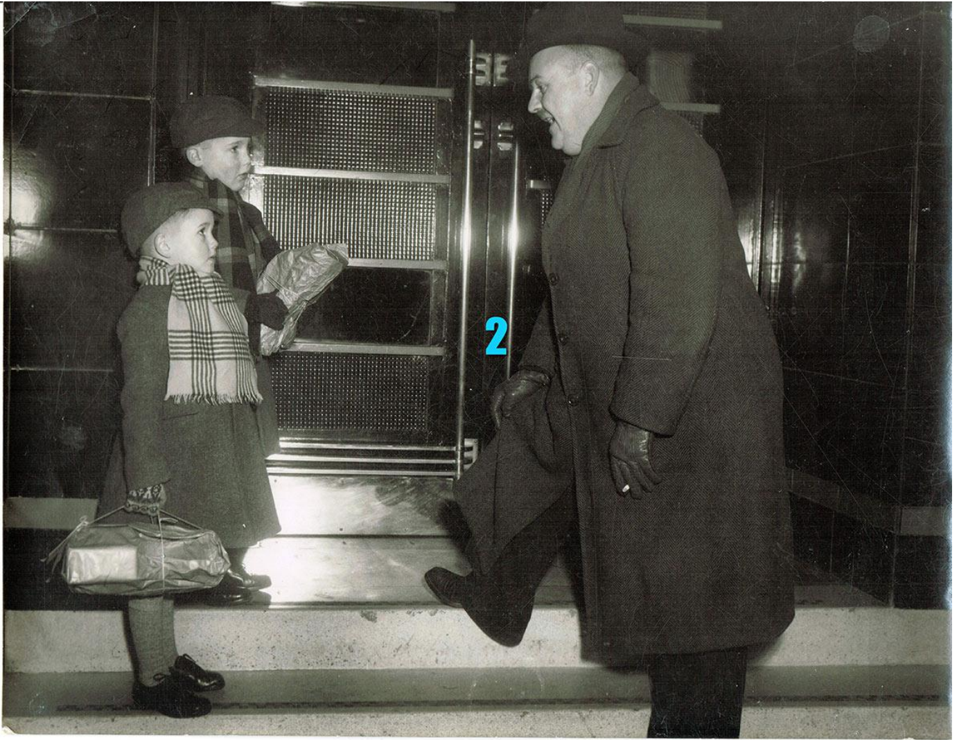
The original design Odeon fin doors with grand chrome handles, chrome kick-plates and 'Odeon glass'. We want to re-install all five pairs for a grand entrance. Two of these doorways are currently blocked by modern brickwork.