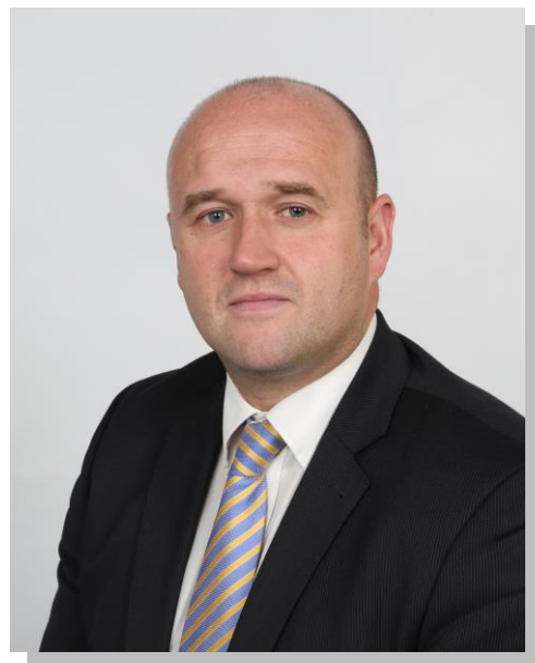
Dafydd Llywelyn Police and Crime Commissioner