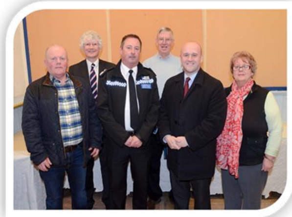
Meeting the community in Tregroes, Ceredigion

In my first few months, I reviewed and restructured my office and have saved over £100,000 in running costs. As a pledge to the communities of Dyfed-Powys, I have not appointed a Deputy Police and Crime Commissioner. This saving, along with others made through the restructure, have been re-invested in my new Community Engagement Team who play an active role in liaising and working with communities, as well as an increased level of funding for Youth Services.