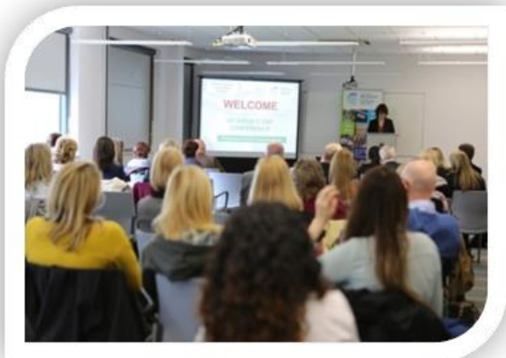
One of the speakers at my St. David's Day Conference